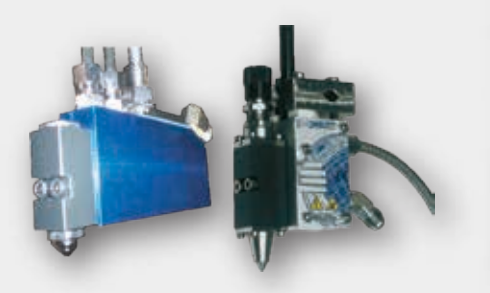
Valco Melton offers a line of guns to suit your application needs, such as the air open/air close and zero cavity modules.