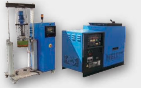
Valco Melton's PUR adhesive application systems come in a variety of sizes to meet most any use or space requirement.